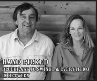
HAND PICKED BLUEGRASS TO SWING... & EVERYTHING IN BETWEEN