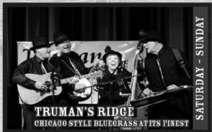
TRUMAN'S RIDGE CHICAGO STYLE BLUEGRASS AT ITS FINEST

ADMISSIONS WEEKEND PASS INCLUDES WALK-IN CAMPING $108 THURSDAY 5PM START $10 FRIDAY OR SATURDAY 10AM TO PAST MIDNIGHT $60 FRIDAY OR SATURDAY 4 HOUR PASS $30 SUNDAY 10AM 11AM GOSPEL HOURS $10 WWW.MIDSUMMERBLUEGRASS.COM PHONE: 715-543-2166 EMAIL: INFO@MIDSUMMERBLUEGRASS.COM