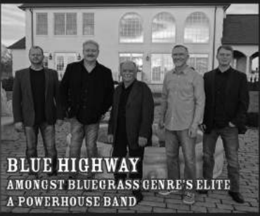
BLUE HIGHWAY AMONGST BLUEGRASS GENRE'S ELITE A POWERHOUSE BAND