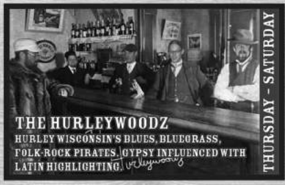
THE HURLEYWOODZ HURLEY WISCONSIN'S BLUES, BLUEGRASS, FOLK-ROCK PIRATES, GYPSY INFLUENCED WITH LATIN HIGHLIGHTING!