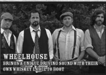
WHEELHOUSE BRINGS A UNIQUE DRIVING SOUND WITH THEIR OWN WHISKEY LABEL TO BOOT