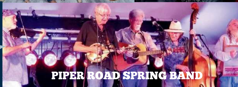
PIPER ROAD SPRING BAND